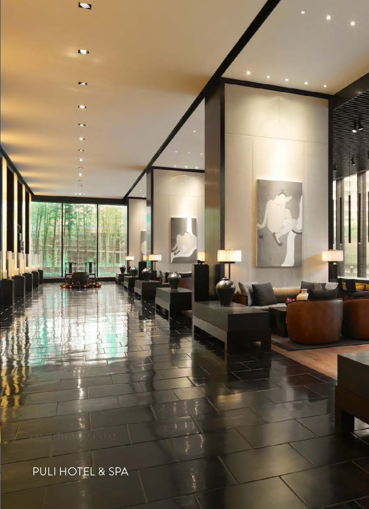
PULI HOTEL &amp; SPA