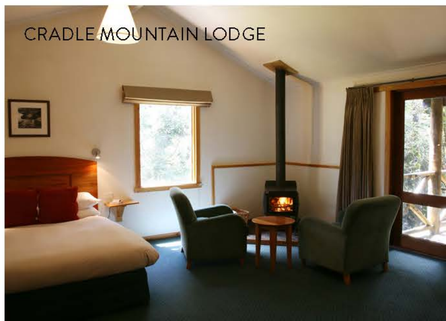
CRADLE MOUNTAIN LODGE

Just two hours scenic drive from Launceston and hour and a half from Devonport, this superb escape showcases the best Cradle Mountain has to offer with warm hospitality, sensational local food and wine, indulgent spa treatments, breathtaking scenery and magnificent wilderness surrounds. Set discreetly within the wilderness setting, the Lodge offers four different styles of accommodation, from the contemporary Pencil Pine Cabins to the luxurious King Billy Suites. Cradle Mountain Lodge provides the perfect haven to escape, rejuvenate, indulge and explore. The national park's walking trails helps you to discover its incredible history, culture and natural beauty. Visit Tasmania's intriguing wildlife and discover the rich heritage of a land that has drawn travelers to its mesmerizing mountains and valleys for years.