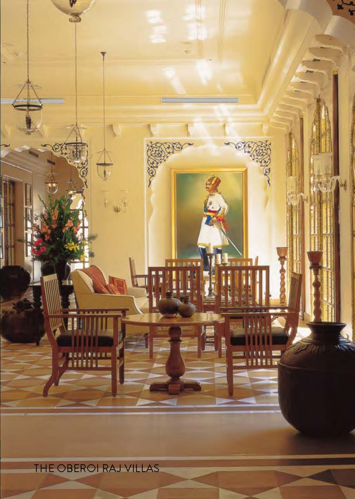
THE OBEROI RAJ VILLAS