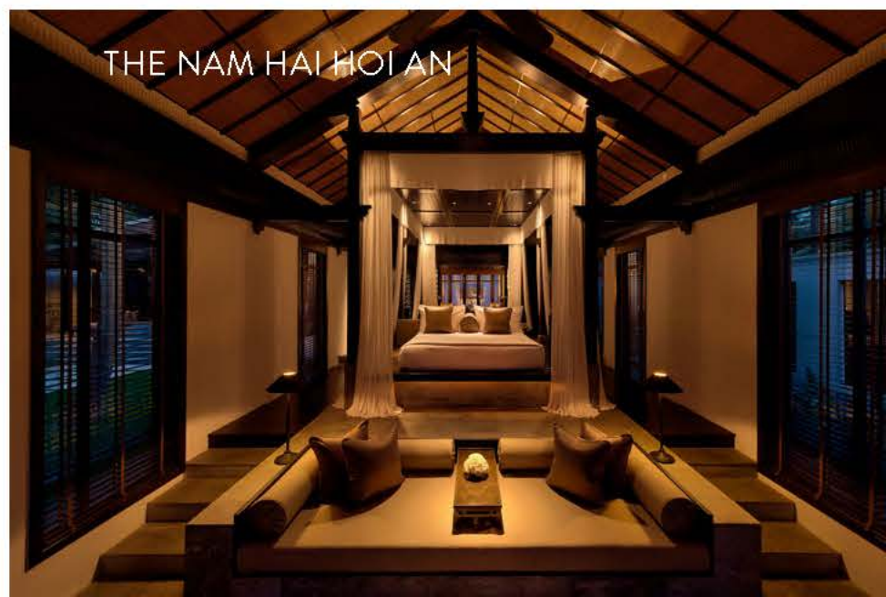
THE NAM HAI HOI AN

The stunning all villa resort located on pristine Hoi An Beach features sixty one bedroom retreats as well as forty privately owned two-to-five bedroom residences each with a private infinity pool. Resort guests and residence owners at this property enjoy impeccable service amid lush landscaping and unobstructed views of the sea. The unique and gracious culture of central Vietnam combines The Nam Hai's unprecedented splendor to deliver luxury experiences. Vietnam has always been a hit for everyone. The food, people, sights and history keep even the most seasoned traveller coming back for more. The resort boasts a serene spa, gourmet cuisine and abundant recreational pursuits including an 18-hole Colin Montgomerie golf course and its elegantly designed ambience.