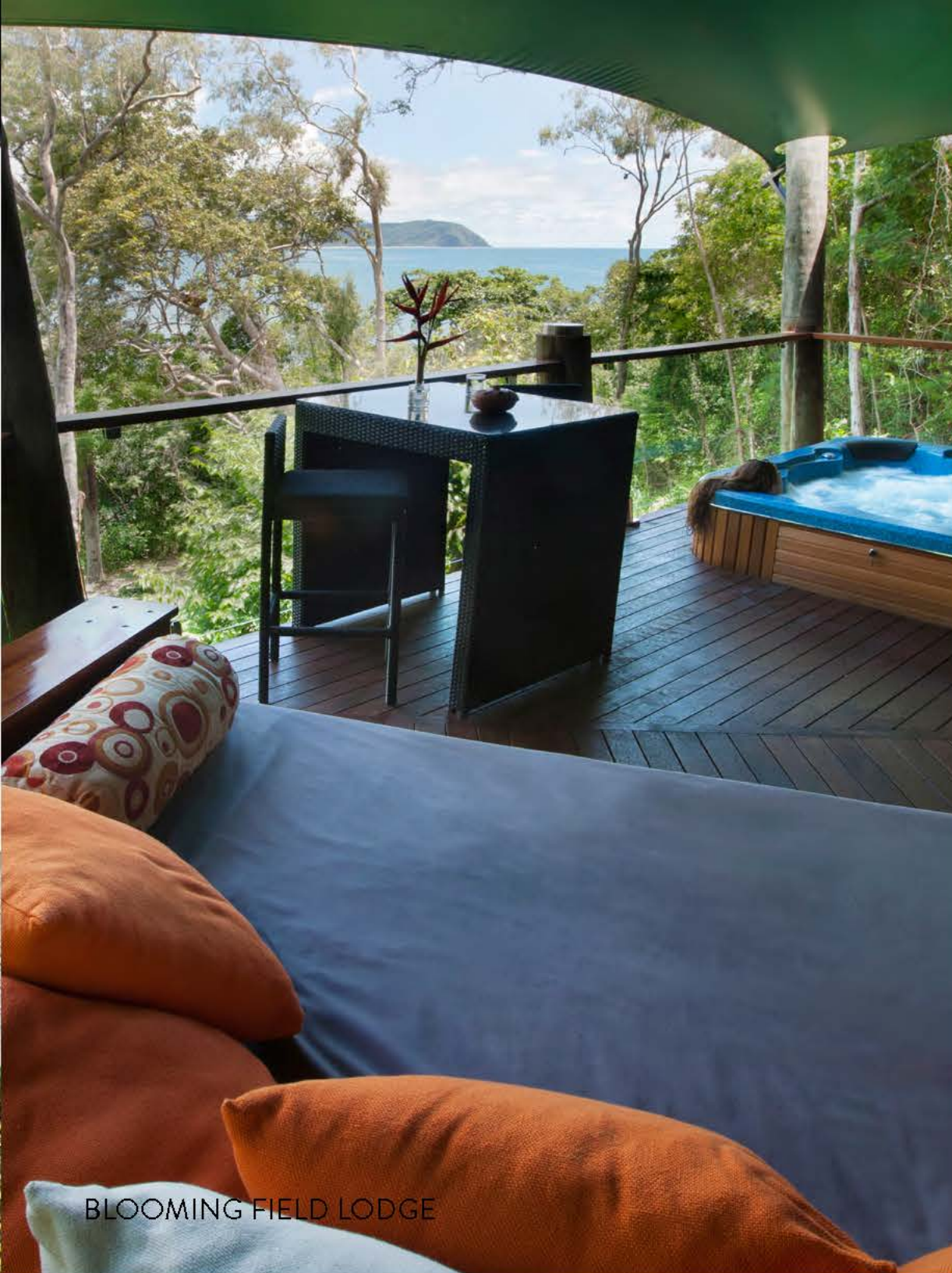
BLOOMING FIELD LODGE